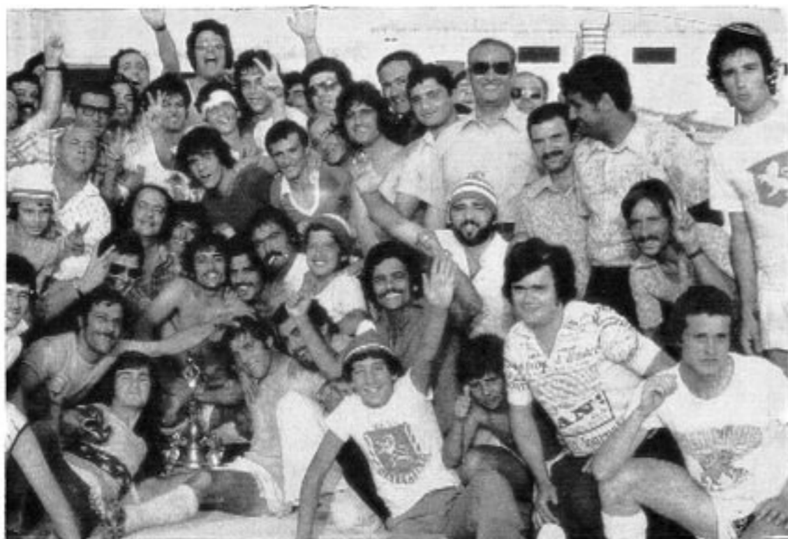
Valletta supporters and players with the F.A. Trophy.