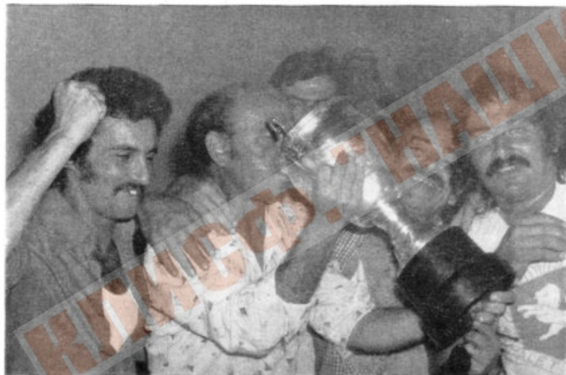
Il-coach tal-Valletta jiccelebra wara r-rebha.