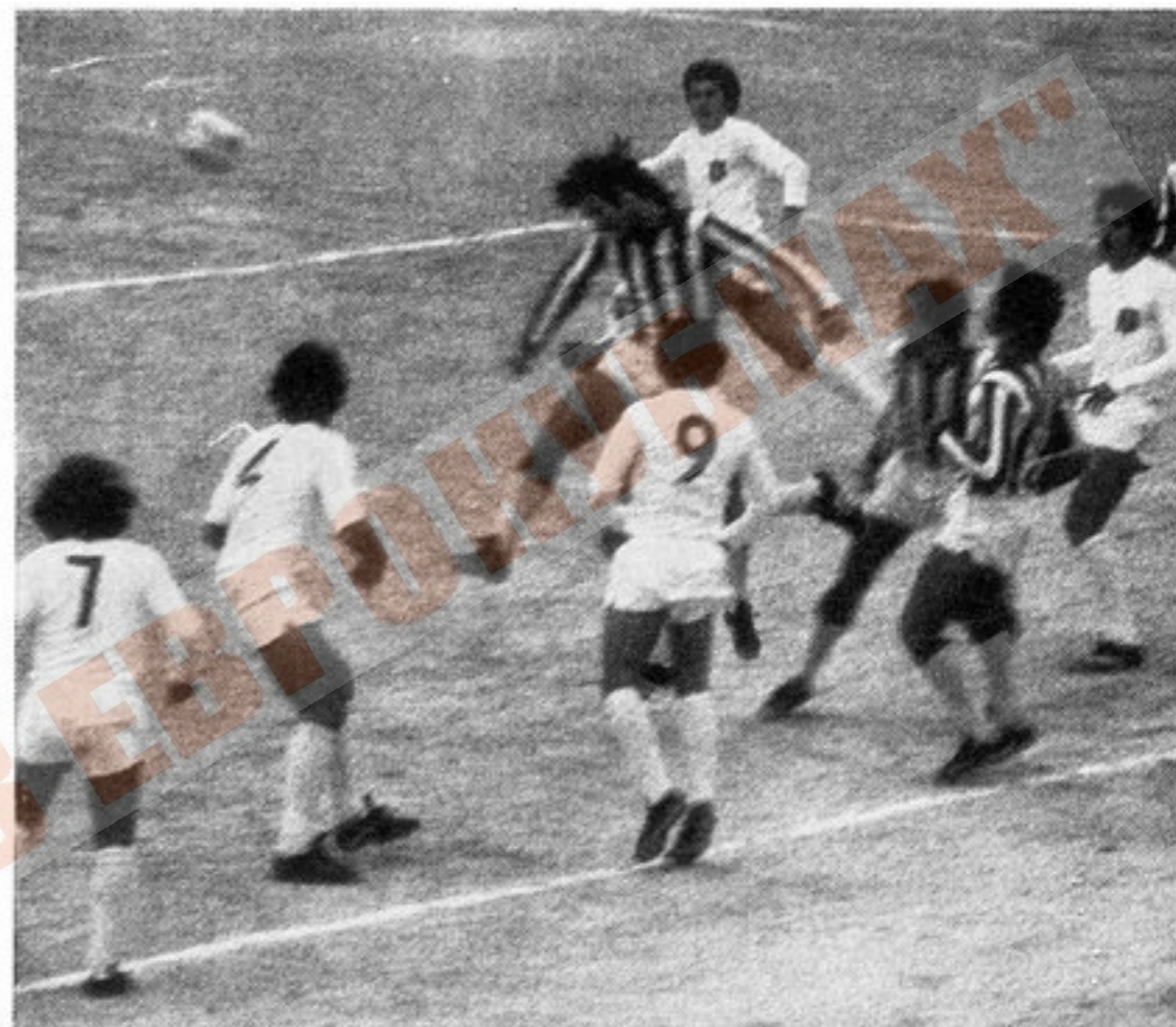
A Floriana defender heads clear during a city attack.