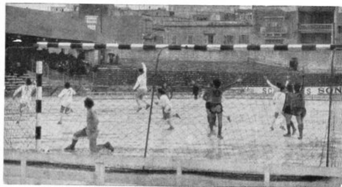
Valletta players cheer up in scoring against Hamrun Spartans. Valletta 2, Hamrun Spartans 1